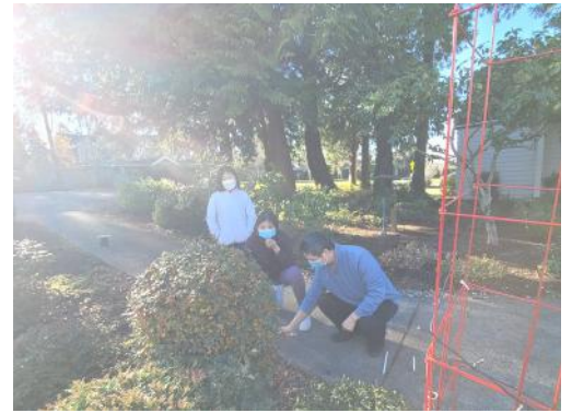
Advent wreathes with Christmas cards were delivered to beloved members of the church.