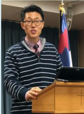
(At the Community Joint Thanksgiving Service)

“On that day the root will stand as a banner for the peoples. The nations will look to him for guidance, and his resting place will be glorious.”