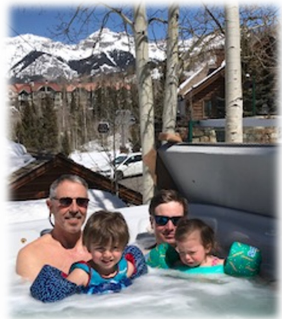
Quick trip to Telluride with Gma & Gdud.

The road to New Mexico accompanied with her cousin and her two dogs