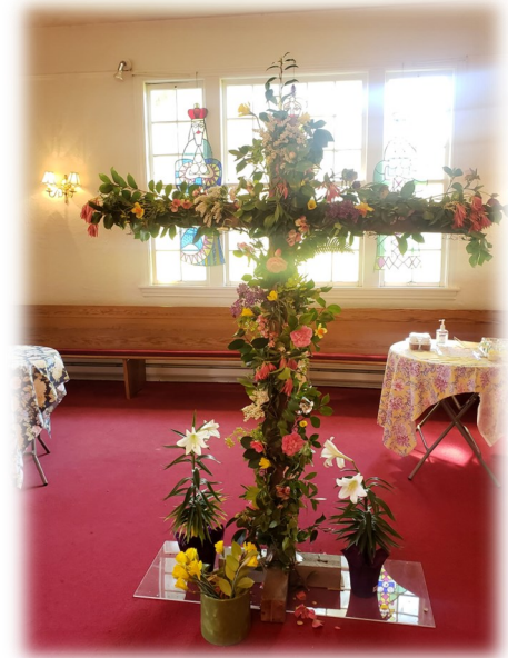
The picture of flowery cross in Easter morning worship